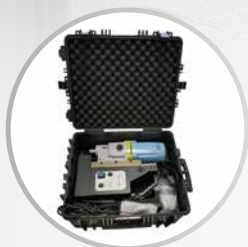
Delivered in carry case