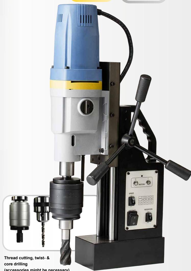
Thread cutting, twist- & core drilling (accessories might be necessary)